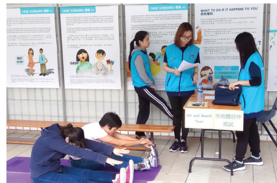
Annual health and fitness assessment is provided to CityU students and staff.