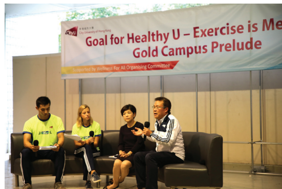
Health Professional and Physical Fitness Professional share the importance of physical activity on campus.